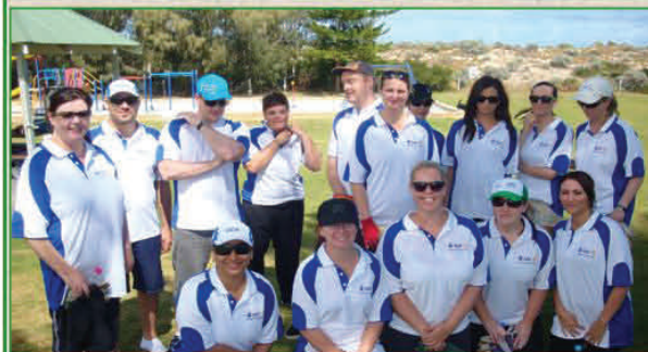
HBF Corporate Group ready to assist in 'Making a difference' at Brighton Beach, Scarborough.

Monitoring and maintenance along the Coastal foreshore is not currently funded to deliver to community and tourists the 'presentation' and the standards desired and expected for essential items such as stormwater drainage and water quality; or for the to be expected ongoing monitoring and maintenance required in such a harsh climate. Numerous access paths and stairs are closed off for extended periods reflecting poorly on the City and compromising beach access by community, while larger budget items go into longer than 5-year-wait timeframes.